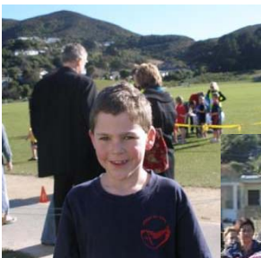
One of our happy Worser Bay runners!