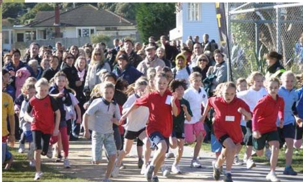
The girls take off!!